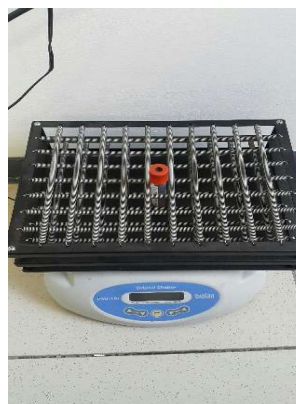
Fig. 2. Orbital shaker.

1 cc PRP was collected from each of the 3 tubes and in an empty tube combined. Then 3 cc PRP was homogenized by a PSU-10i, orbital shaker for 5 min and 300 rpm [Fig. 2]. The counting of the platelets were done from deep, middle and top of the homogenized PRP by collecting 0,01ml samples [Fig. 3A,B,C].