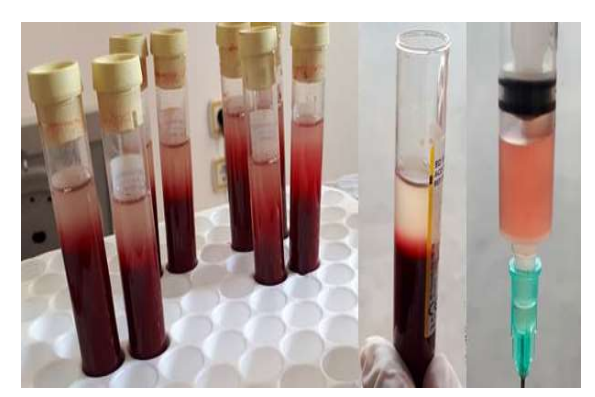
Figure 2. Appearance of the rat platelet-rich plasma.

number of platelets compared to human PRP with the same concentration ratio. In terms of appropriate concentration, when human PRP is in the range of 1–1.5 million, this number increases to 2.5–3 million for rat PRP acquisition. About 6 ml of blood must be used to obtain a high concentration of 0.7 ml PRP (3). A single-stage centrifuge will usually not be sufficient when preparing rat PRP. After the first centrifuge all plasma is collected by a pipette after a second spin in a sterile tube. Platelets should be collected and homogenized by shaking the plasma without measuring the PRP values (3).